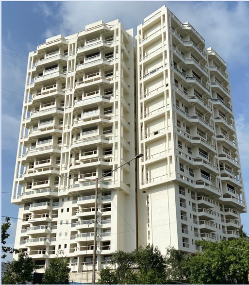
BAY VIEW – Juhu Versova Link Road