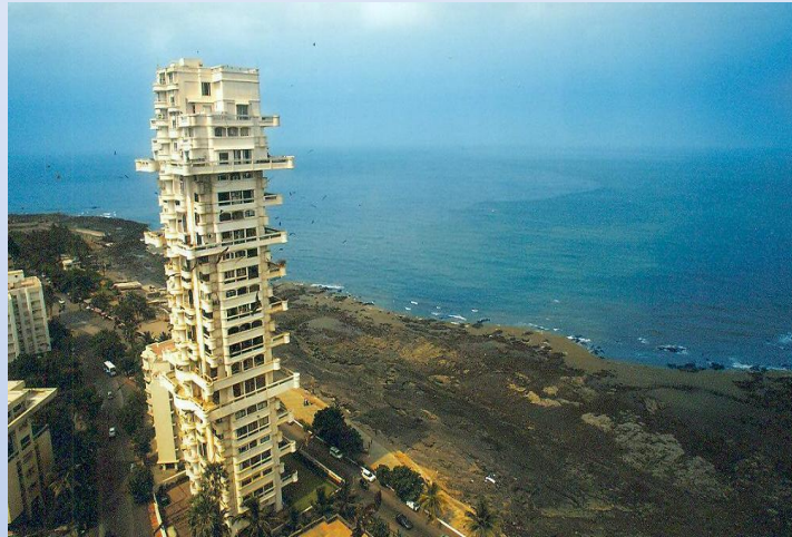
JIVESH TERRACE - Bandstand