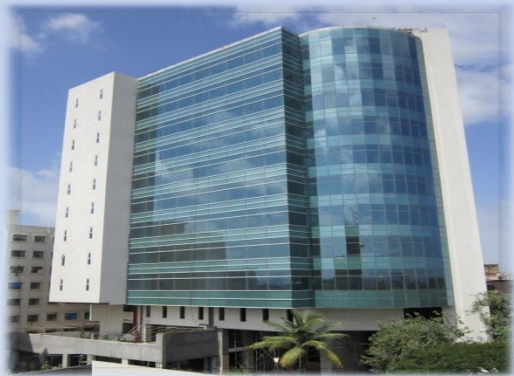
VISHWAS – UPL House – Bandra E