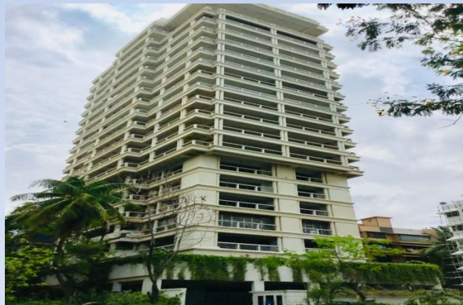
VARTAMAAN – Juhu Versova Link Road